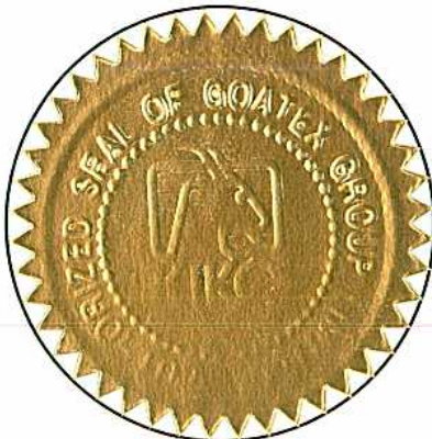
Registered Seal American Kiko Goat Association