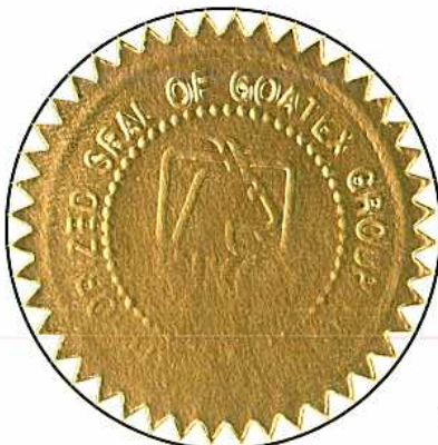
Registered Seal American Kiko Goat Association