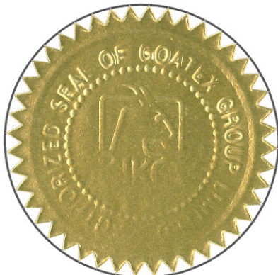
Registered Seal Goatex Group Limited