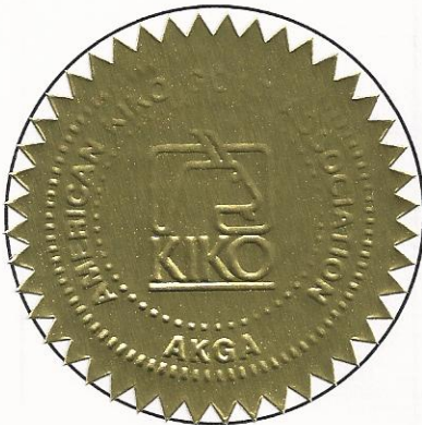
Registered Seal American Kiko Goat Association