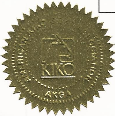
Registered Seal American Kiko Goat Association