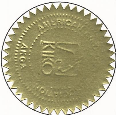
Registered Seal American Kiko Goat Association